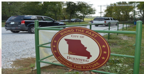
MAIN GATE ENTRANCE